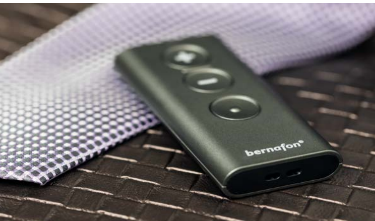
Bernafon RC-A remote control

Alternatively, regulate the volume and change programs with the discreet RC-A remote control. Small and slim, the RC-A fits easily in every pocket, in every handbag and clutch, and lies comfortably in your hand.