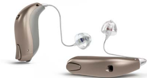
Bernafon Zerena miniRITE