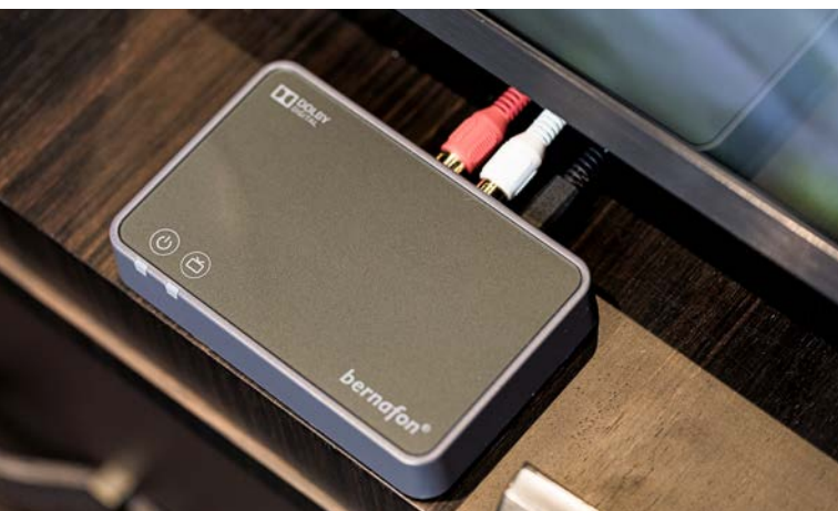
TV-A adapter connected to the TV

Do you want to have the sound from your TV streamed directly into your ears? This is possible with Zerena hearing aids and the TV-A adapter. Watch TV at your preferred volume and enjoy premium Dolby Digital® Stereo sound quality.