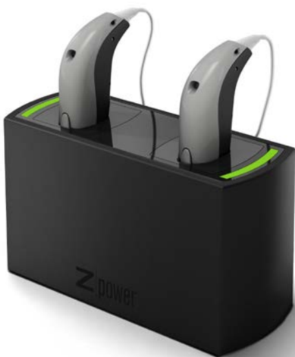
Zerena rechargeable miniRITE in the battery charger

By using the rechargeable option, you can save time by not having to buy and dispose of hearing aid batteries. You also don't need to think about changing the batteries every few days. And, you are doing something good for the environment too.